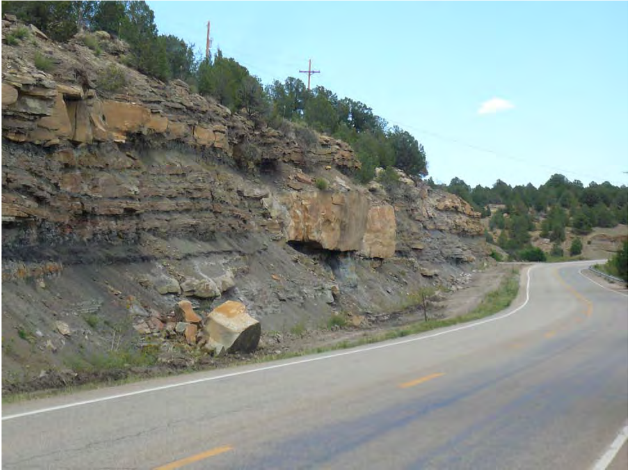
Figure 11. Rockfall events along Highway 12, east of Valdez, temporarily closed the highway. Some boulders were in excess of 6 feet across. CDOT quickly cleaned up the roadway.