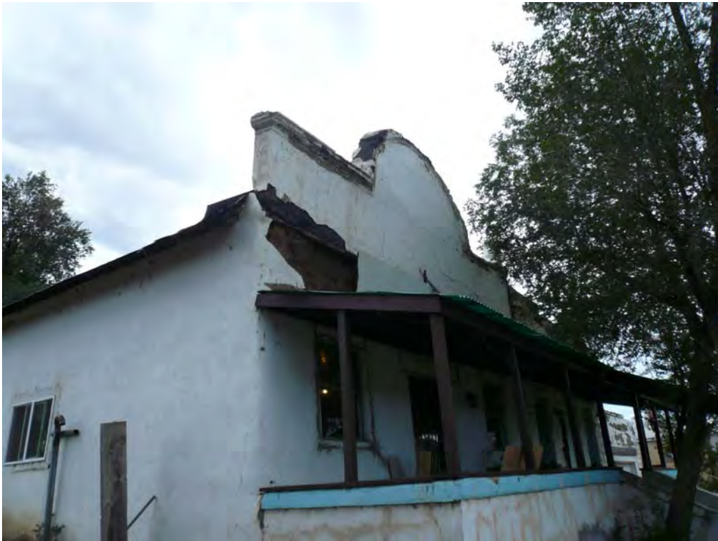
Figure 1. Highly damaged residence in Segundo where the façade has crumbled and pulled away from the main structure.