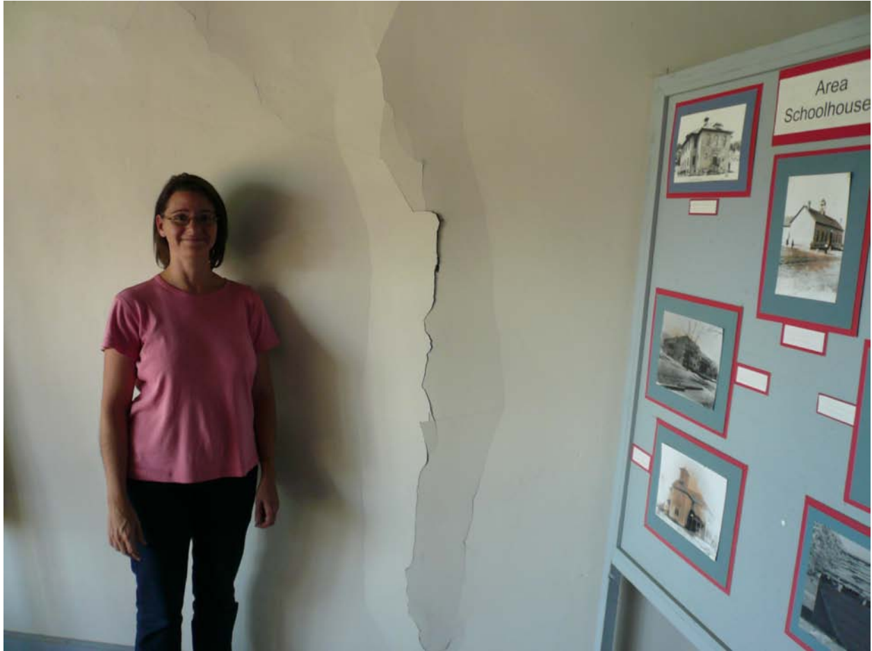
Figure 19. A 10 foot long vertical crack in the upstairs floor of the Cokedale post office/city hall.