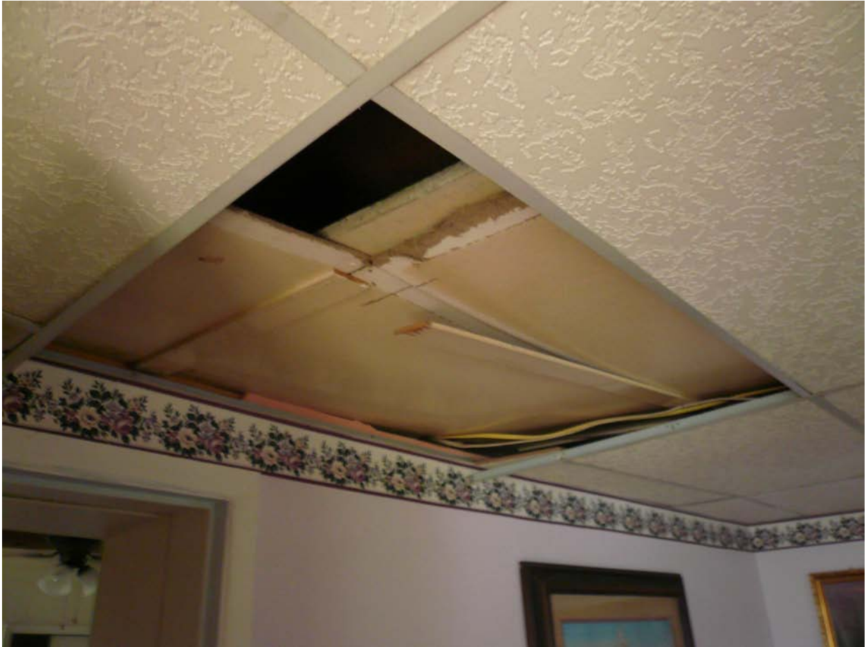
Figure 15. A ceiling panel collapsed sending debris on the resident's bed. Segundo, CO.