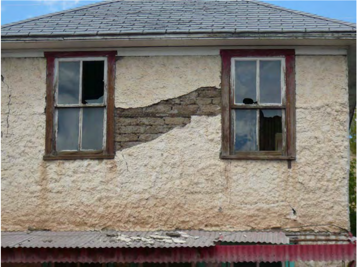
Figure 12. An old adobe building in Segundo with cracked and displaced plaster.