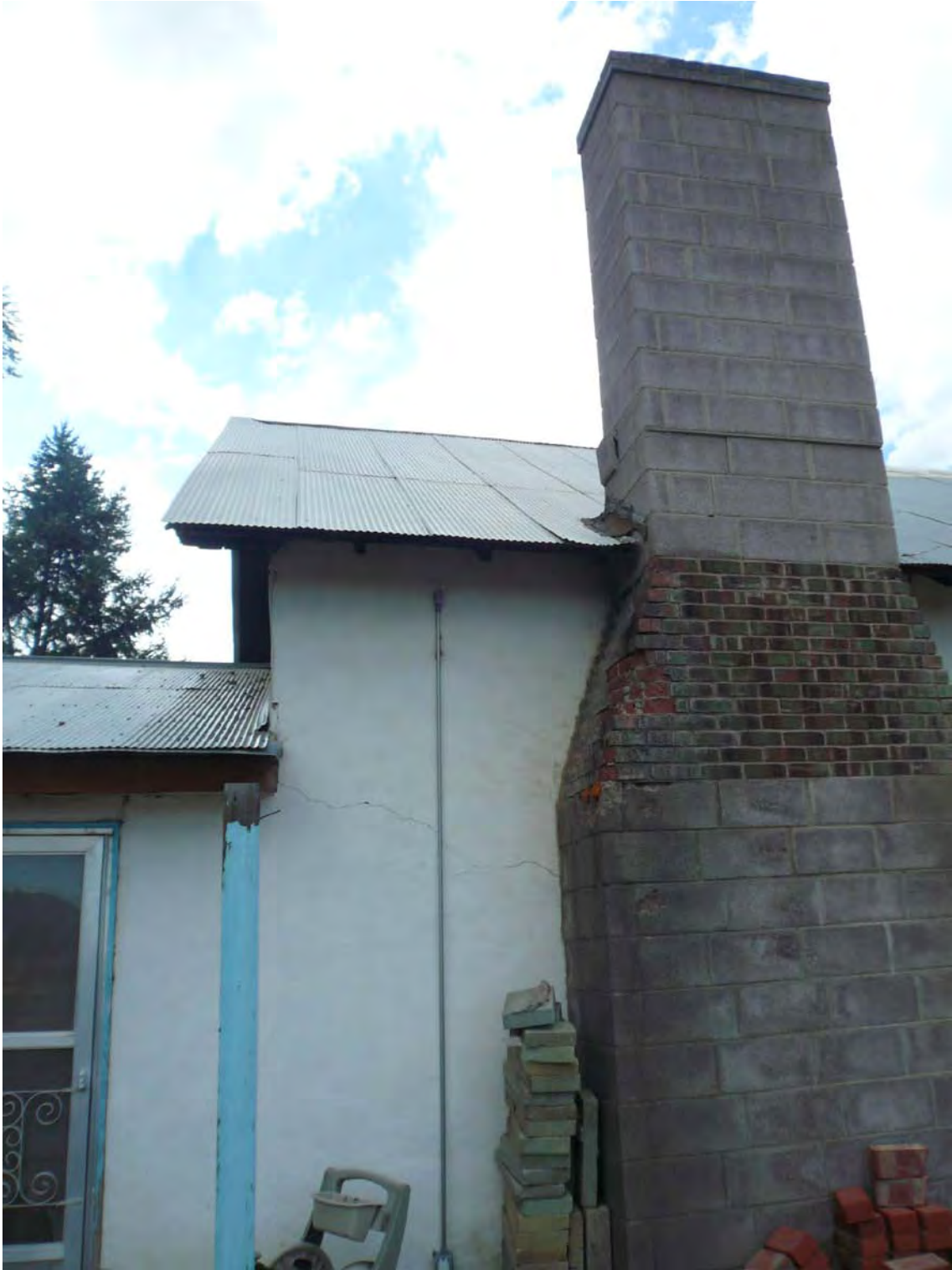
Figure 7. Chimney displaced approximately 2". Segundo, CO.