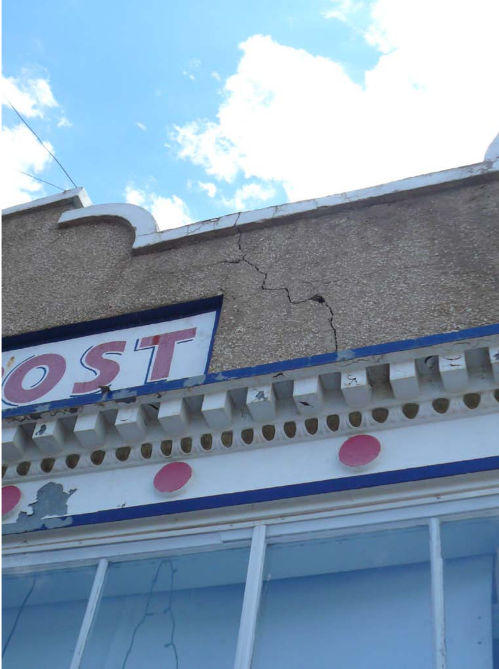
Figure 10. Cracked plaster on Ringo's Market in Segundo, CO. All of the liquor bottles inside were thrown to the floor and walls were cracked.