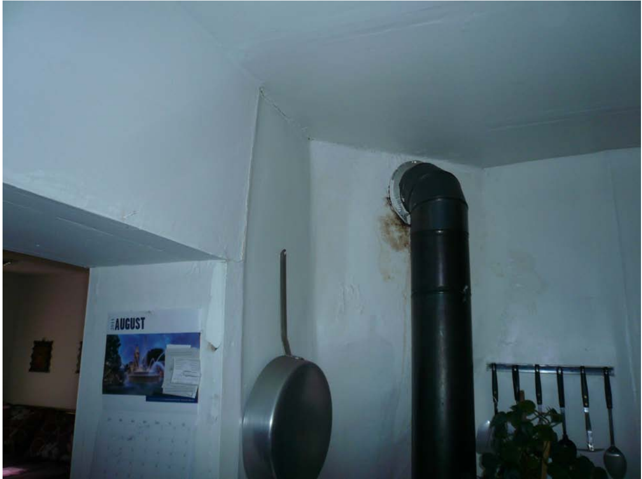
Figure 14. Chimney from a stove was pulled from the wall. Segundo, CO.