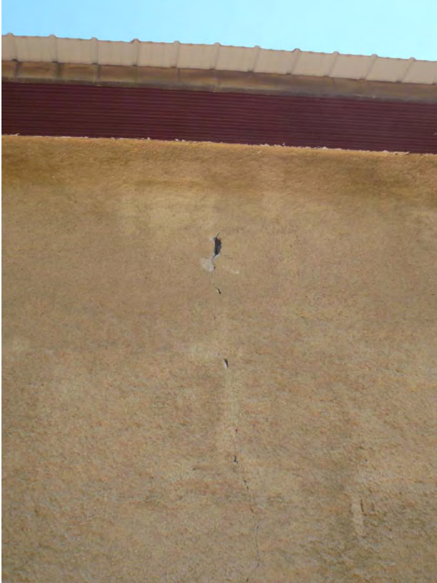
Figure 21. A large piece of plaster missing from an external crack on the Cokedale post office.