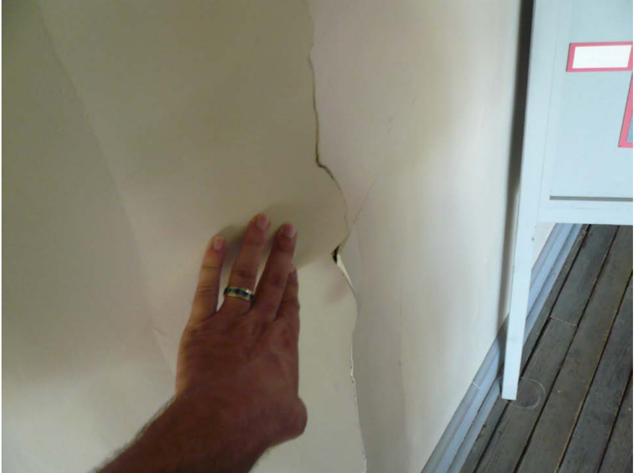
Figure 20. A few inches of buckling along the same crack in Figure 19. Cokedale, CO.