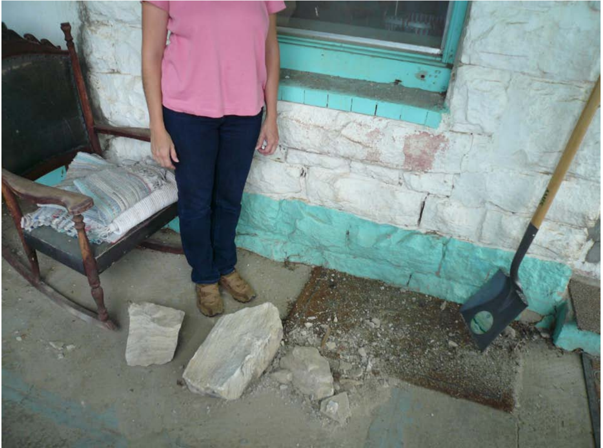
Figure 2. Two-foot-long rock blocks from the façade that fell 10 feet through the front porch roof. Segundo, CO.