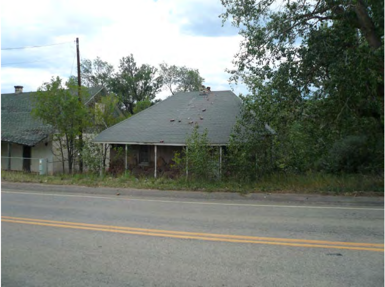
Figure 9. The earthquake toppled this chimney sending a few bricks onto State Highway 12. Segundo, CO.