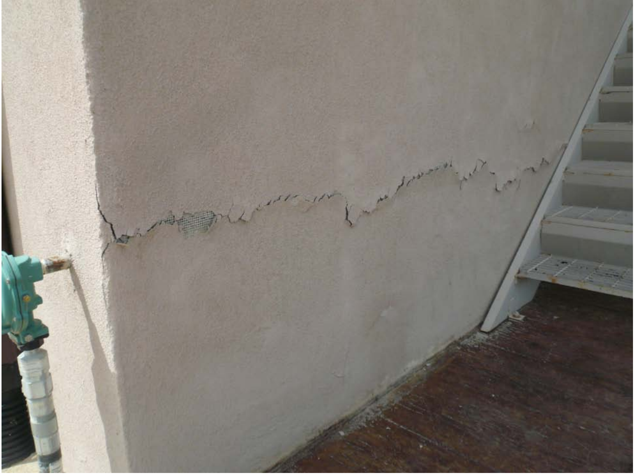
Figure 17. Cracked plaster at the Big 4 Country Store in Valdez, CO.