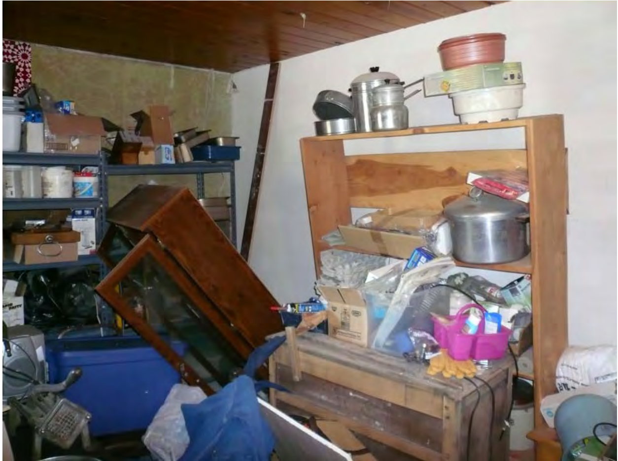
Figure 4. Large bookcases were toppled over from the shaking. The resident reported S-N movement. Segundo, CO.