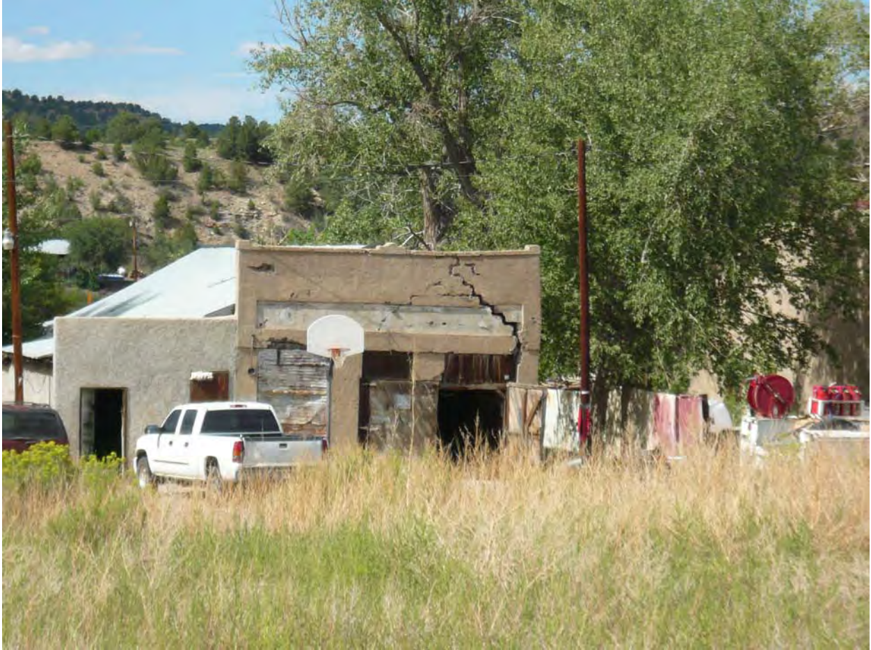
Figure 18. A severely damaged garage in Valdez, CO.