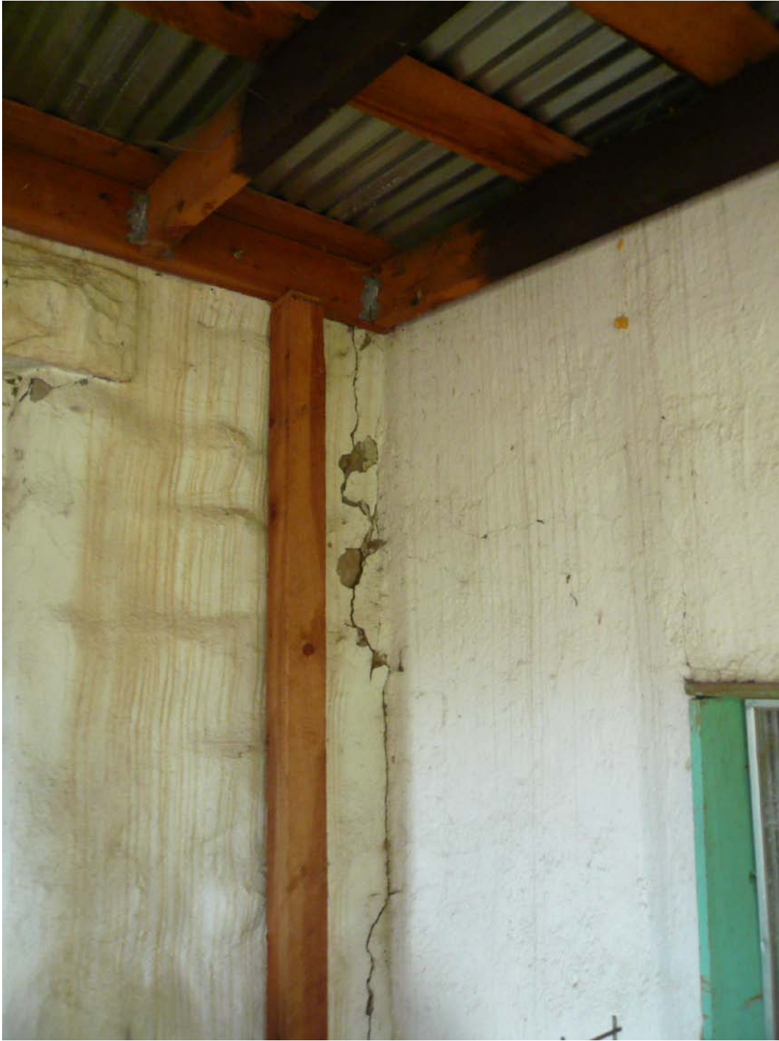
Figure 6. Cracked and missing plaster was pervasive. Segundo, CO.