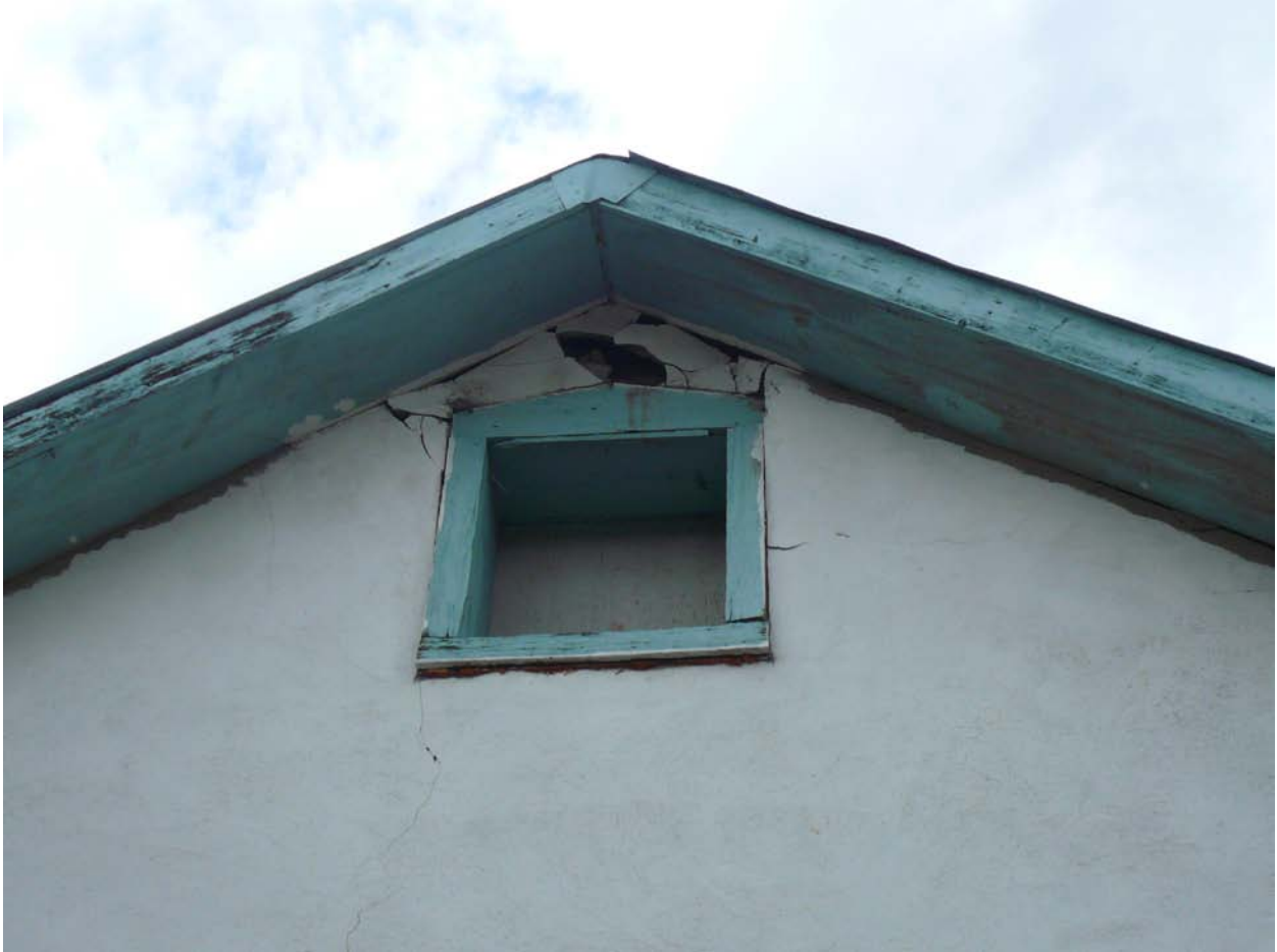
Figure 13. Major plaster and brick damage to a home in Segundo, CO.