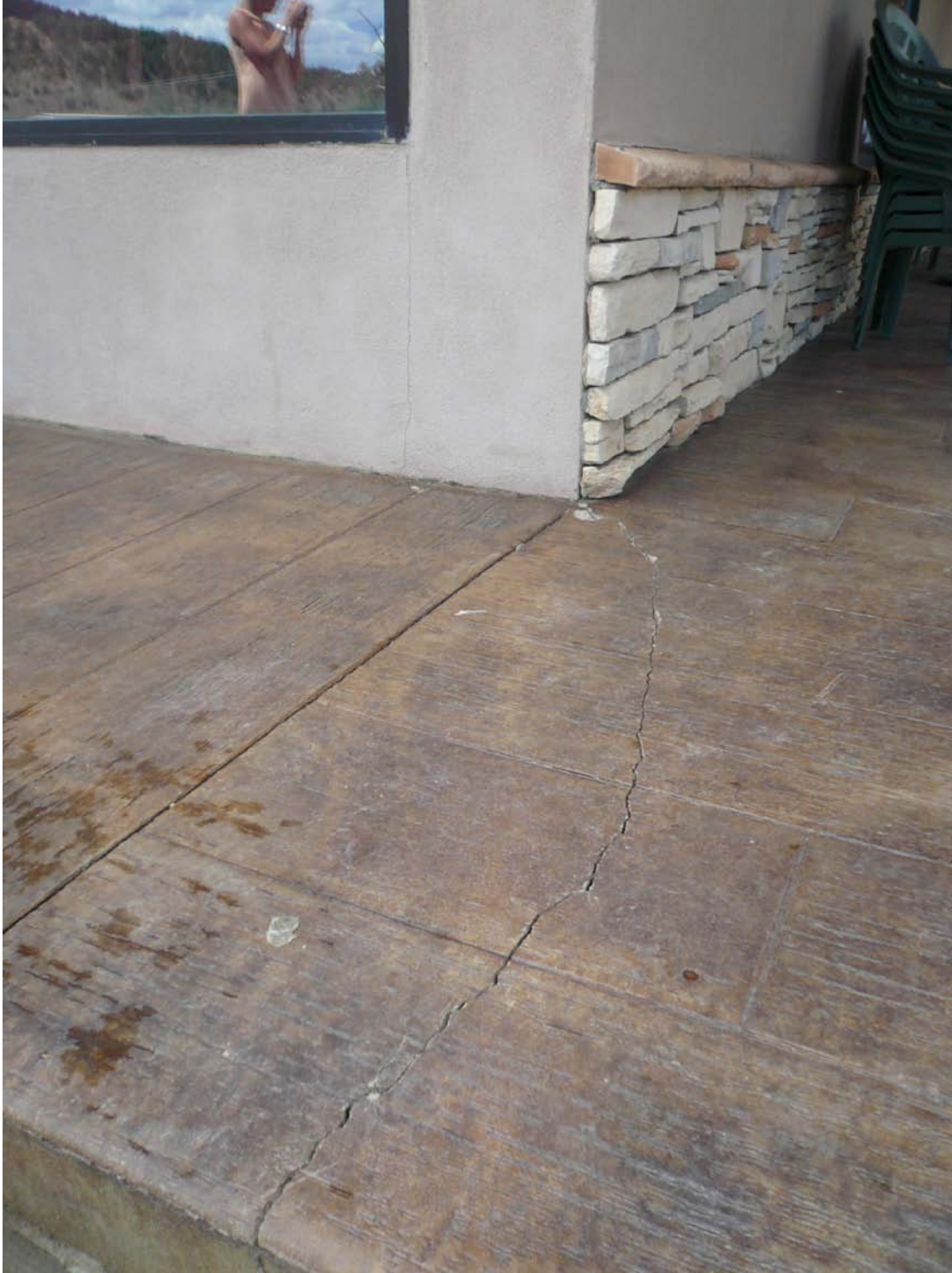
Figure 16. A five-foot-long crack in the concrete at the Big 4 Country Store in Valdez, CO.