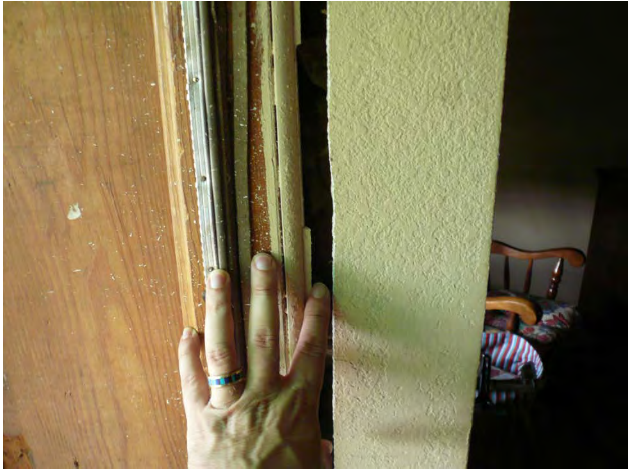
Figure 3. The exterior wall pulled away approximately 1" from the interior wall. Segundo, CO.