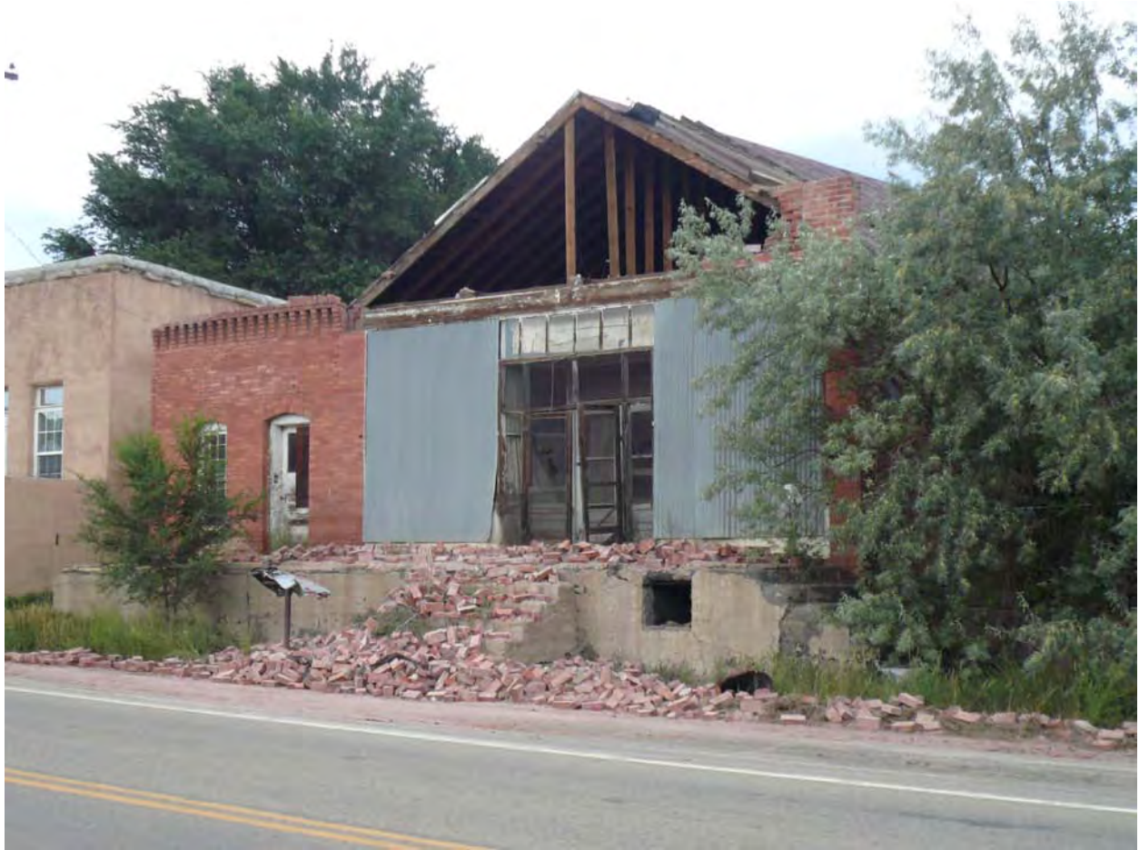
Figure 8. The front of this brick building collapsed, sending debris onto State Highway 12. Note the crushed mailbox. Segundo, CO.